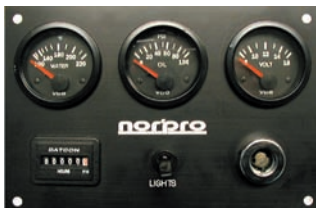
Standard Analog 100 Panel

Warranty Information 5 Year/5000 hour genset warranty