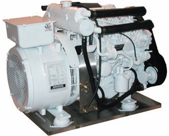
(Some options may be shown)

Type.....3 cyl., 4 cycle, water cooled, OHV Fuel System.....indirect injected Bore & Stroke (in.).....3.05 x 3.14 Piston Displacement (cu.in).....68.6 Compression Ratio.....22:1 Coolant Capacity (Block qts.).....2.3 Lube Oil Capacity (qts.).....4.8 dB(A) @ 7 meter w/o intake & exhaust attenuated.....75 dB(A) @ 7 meter w/sound shield & muffler.....55 Fuel Consumption at Full Load.....1 gph Warranty.....5 year 5000 hour