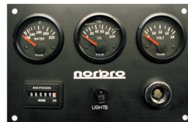
Analog 100 Control Panel

Delivering excellence one product at a time